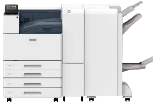
With 2 Tray Module and C3 Finisher with Booklet Maker and Folder Unit CD1

Staple capacity of up to 50 / 65 sheets* / Punch* / Saddle Staple / Single Fold