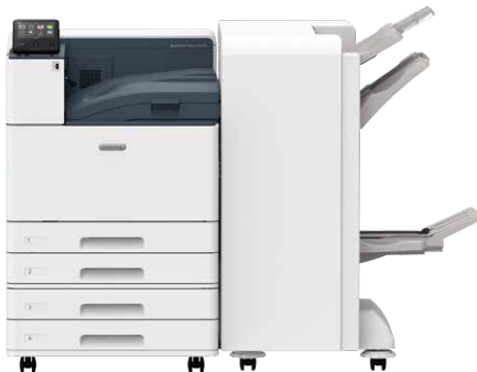
With 2 Tray Module and C3 Finisher with Booklet Maker

Staple capacity of up to 50 / 65 sheets* / Punch* / Saddle Staple / Single Fold