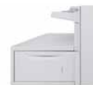
A3 High Capacity Feeder 2,000 sheets: Up to SRA3