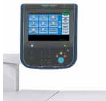
Integrated Copy/Print Server