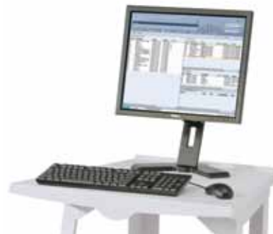
FreeFlow® Print Server