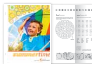
Colour Inserts, Staple and Engineering Z-Fold