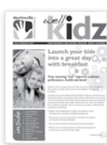
Squarefold Trim Booklet