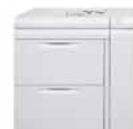
High Capacity Feeder C2-DS 2,000 sheets each tray (4,000 sheets total): Up to SRA3