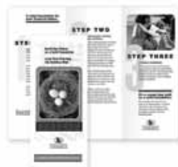
Bi-Fold, C-Fold, Z-Fold