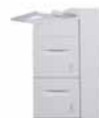
A4 High Capacity Feeder 2,000 sheets each tray (4,000 sheets total): A4-size